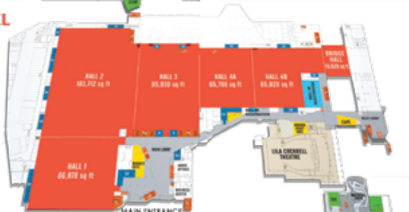
Exhibit Hall 1-4B Bridge Hall USA Cockrell Theater Main Lobby, Business Center Work Lobby