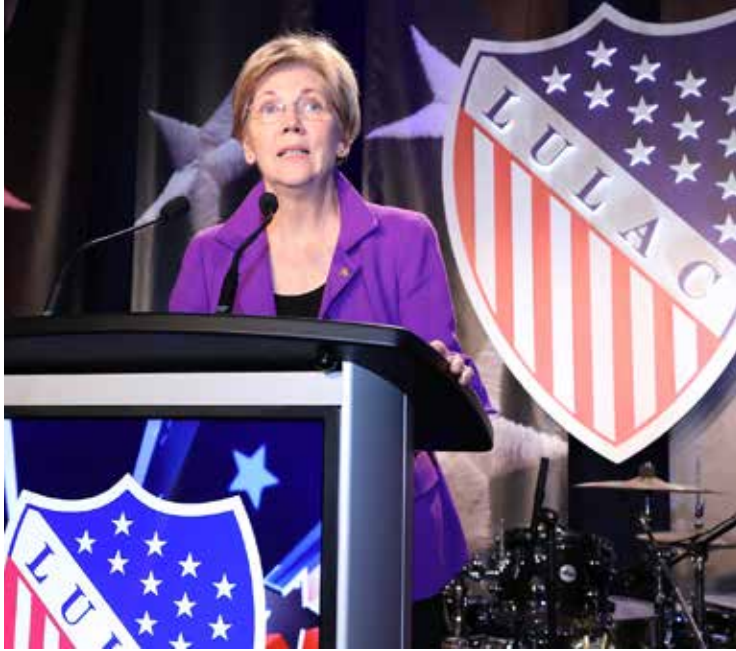
Senator Elizabeth Warren speaks to the LULAC membership.