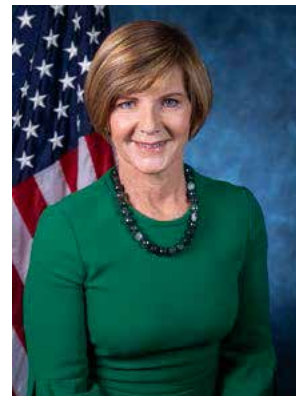
Susie Lee Member of Congress

A handwritten signature in black ink that reads "Susie Lee".