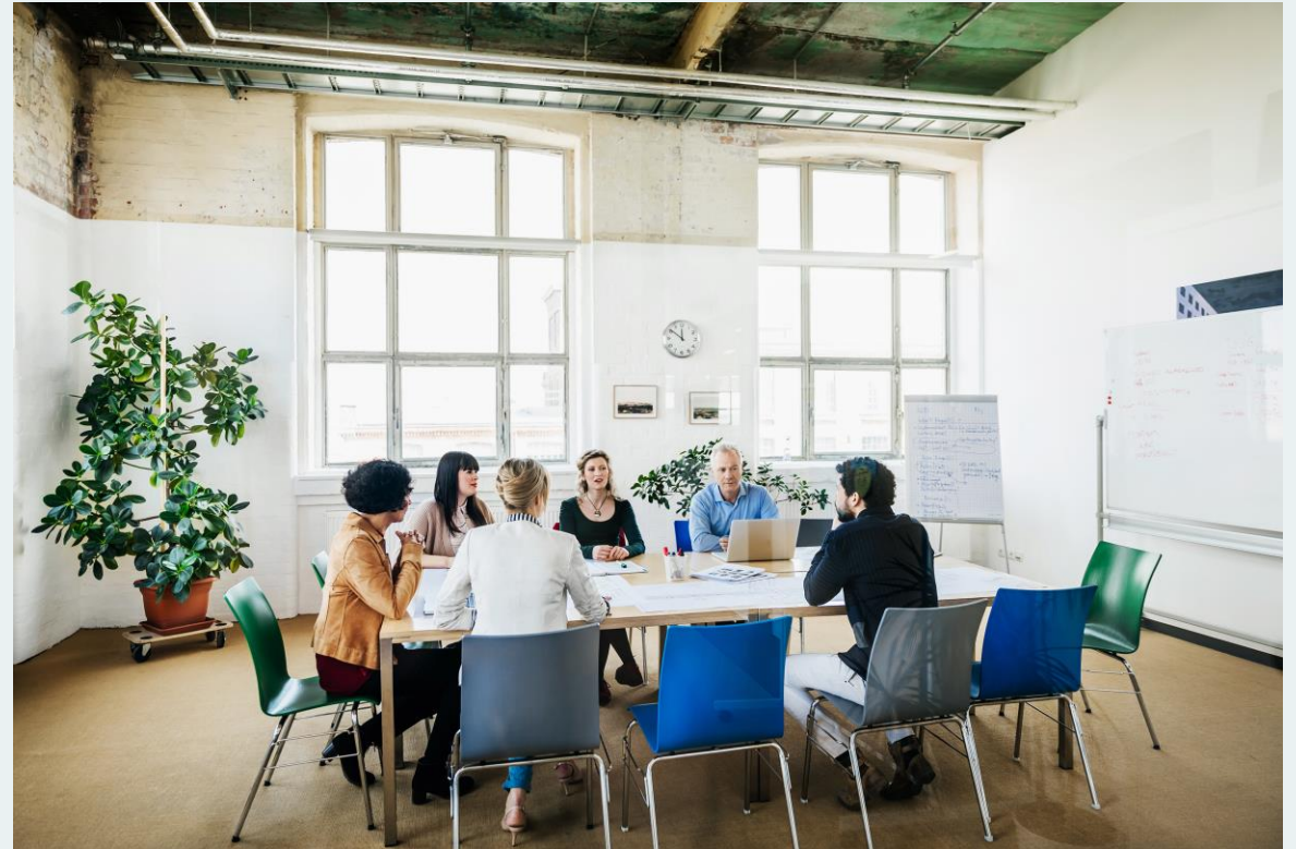
Executive Core Qualifications (ECQs)