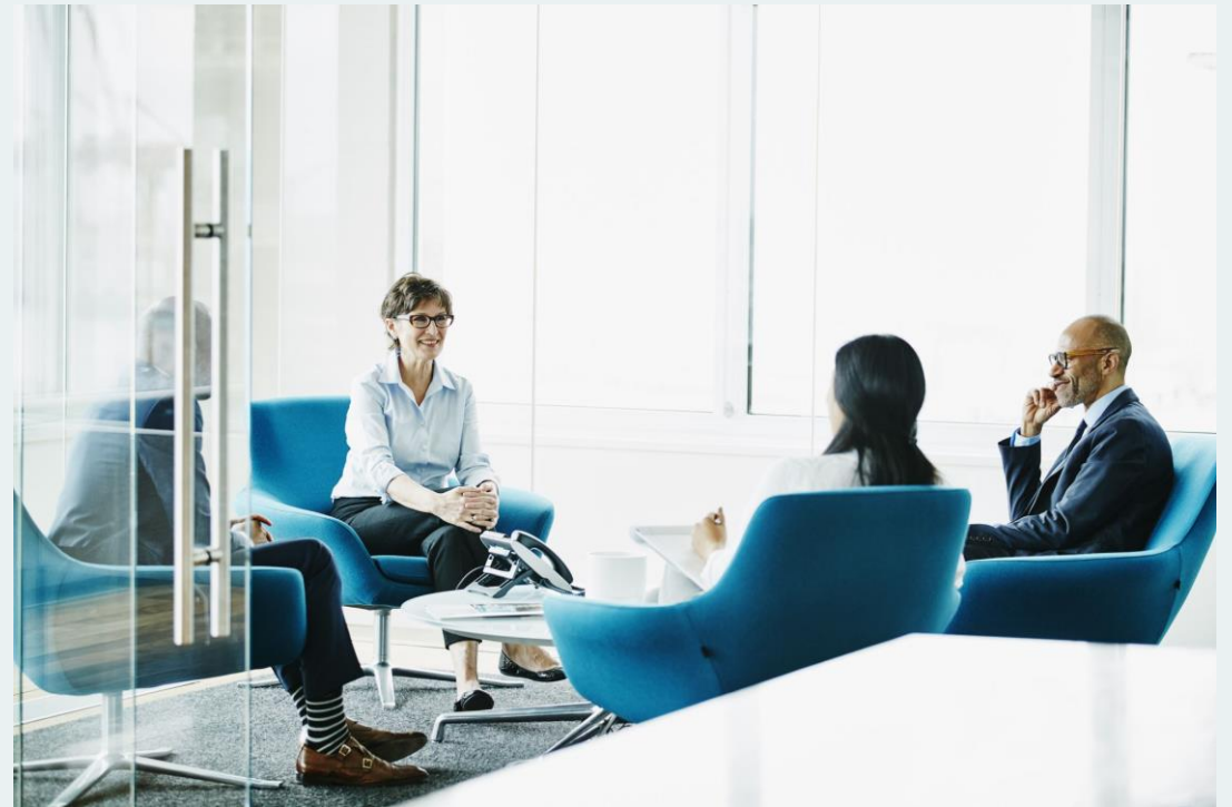
Executive Core Qualifications (ECQs)