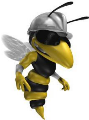
The Worker Bee