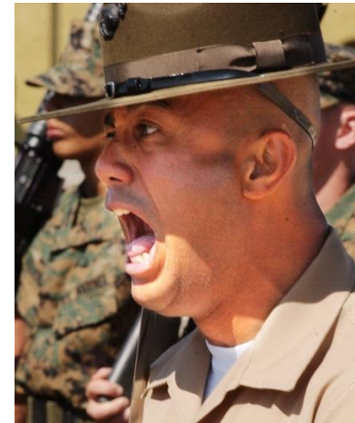
The Drill Sergeant