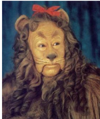
The Cowardly Lion