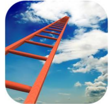
The Former Drone