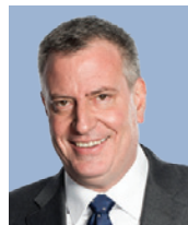
Bill de Blasio Mayor New York City