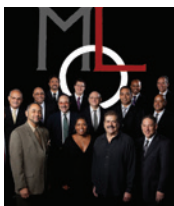
Mambo Legends Orchestra