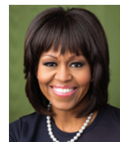
Michelle Obama First Lady