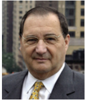
Abraham Foxman National Director Anti-Defamation League