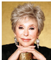
Rita Moreno Actress