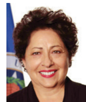
Katherine Archuleta Director, Office of Personnel Management