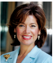
Maria Contreras- Sweet Administrator, Small Business Administration