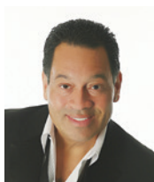
Tito Nieves Singer