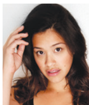
Gina Rodriguez Actress