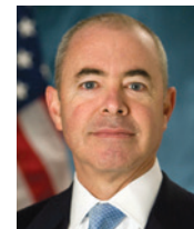
Alejandro Mayorkas Deputy Secretary, Department of Homeland Security