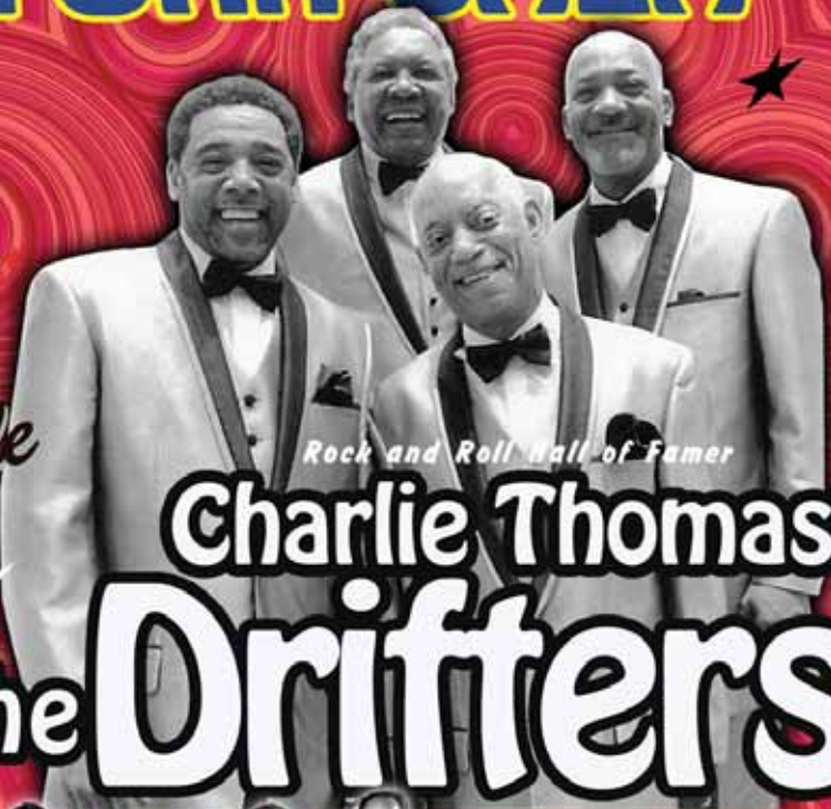
Rock and Roll Hall of Famer

The ULTIMATE OLDIES PARTY!!! New York Style FEATURING