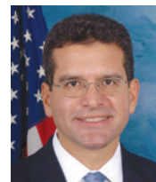
Pedro Pierluisi U.S. House of Representatives, PR