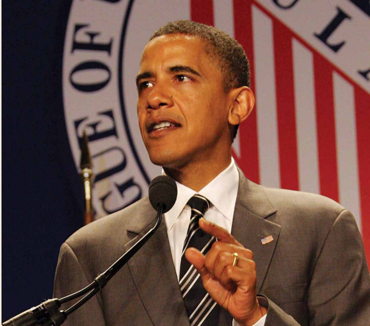
President Barack Obama speaks at the 2008 convention.