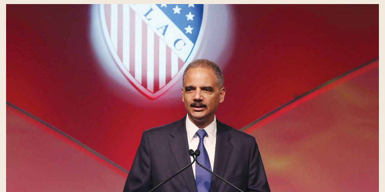
ABOVE: Color Guard at Presidential Awards Banquet. BELOW: U.S. Attorney General Eric Holder speaks at Unity Luncheon

Concierto: Voces Unidas por America: LULAC's United Voices Concert features top Latino entertainment in an event that is free and open to the public. Minimum Sponsorship: $25,000